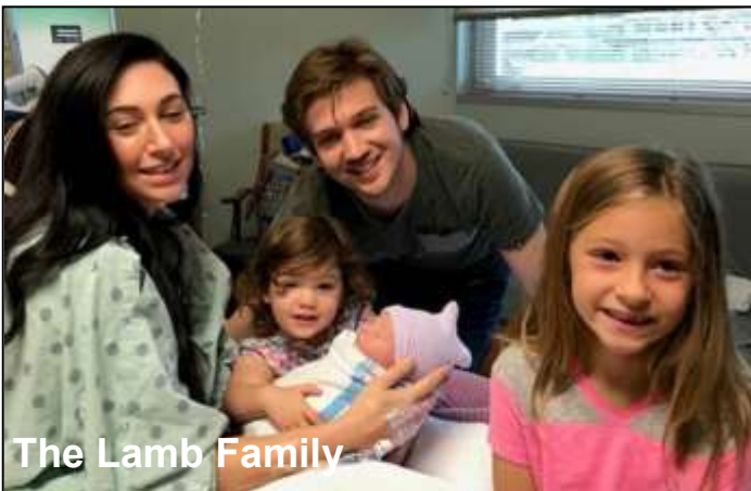
The Lamb Family